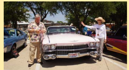
Winner of the car show lottery ticket 50-50 drawing