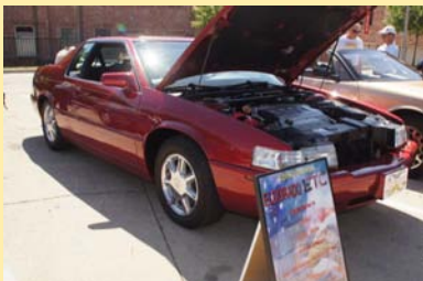
Bill Levy's 2001 Eldorado ETC and Show Bear