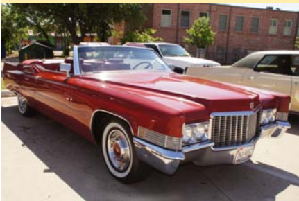
John Foust's 1970 Convertible complete with emergency rations (doughnuts and hot dogs)