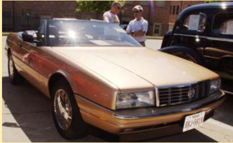
Ron Fishell's 1987 Allante