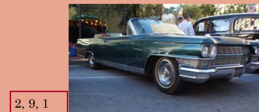
2, 9, 1