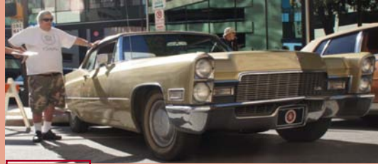
6, 14, 16