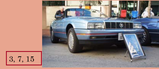
3, 7, 15