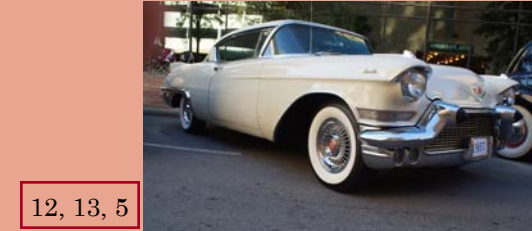
12, 13, 5