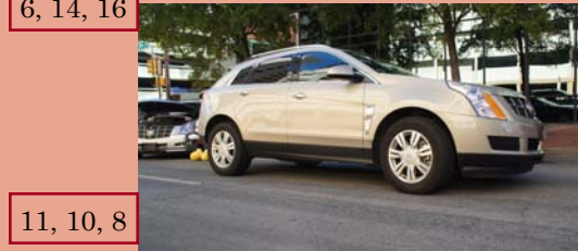
11, 10, 8