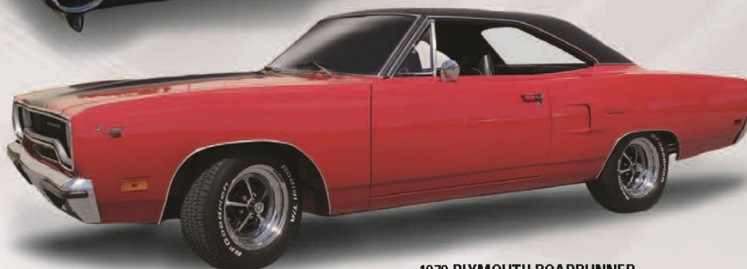
1970 PLYMOUTH ROADRUNNER TWO DOOR HARDTOP