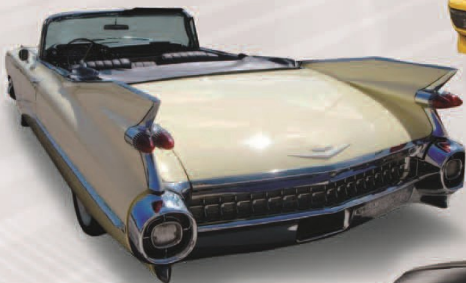
1959 CADILLAC SERIES 62 CONVERTIBLE