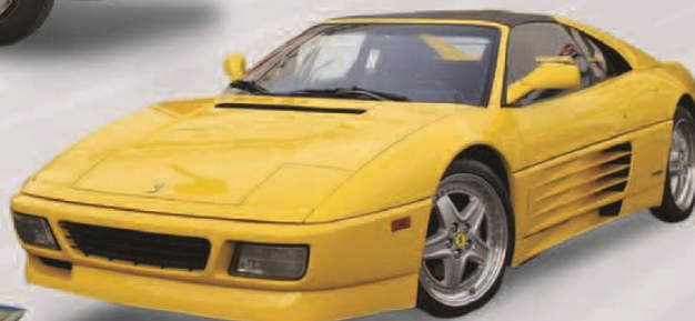
1992 FERRARI 348 TS TARGA