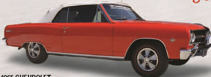
1965 CHEVROLET CHEVELLE MALIBU SS