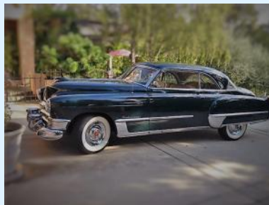
1949 Cadillac Coupe DeVille

I might note here that although I have retired in Arizona and serve the Sonoran Desert Region and Snake River Region, my home town is Saint Louis, Missouri, my people are in McKinney, Houston, Henderson and Temple, Texas and I'm honored to be an adopted member of the North Texas Region. "THAT'S MY STORY AND I'M STICKIN' TO IT" Be safe.