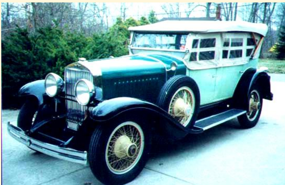
1927 Cadillac LaSalle Phaeton 303

Production: 12,000 (model year); 16,850 (calendar year)