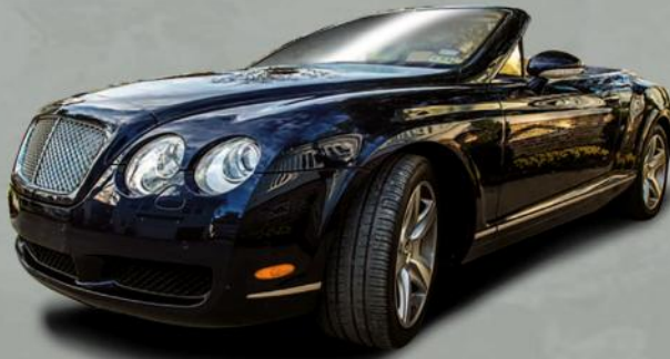
2008 Bentley Continental GT SOLD: $86,900 OKC 2015

Extended to 3 Days!! February 19, 20 & 21 OKC Fairgrounds