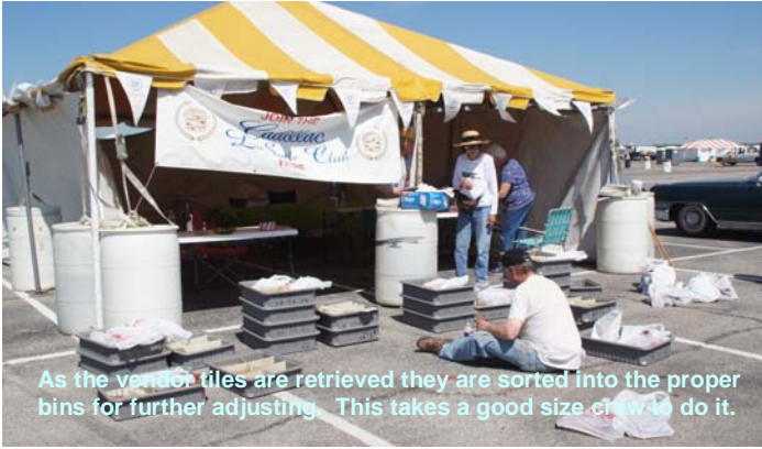
As the vendor tiles are retrieved they are sorted into the proper bins for further adjusting. This takes a good size crew to do it.