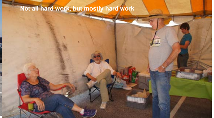
Not all hard work, but mostly hard work