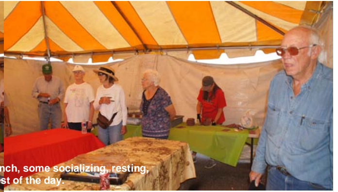
Noon break for a prayer, lunch, some socializing, resting, and the rest of the day.