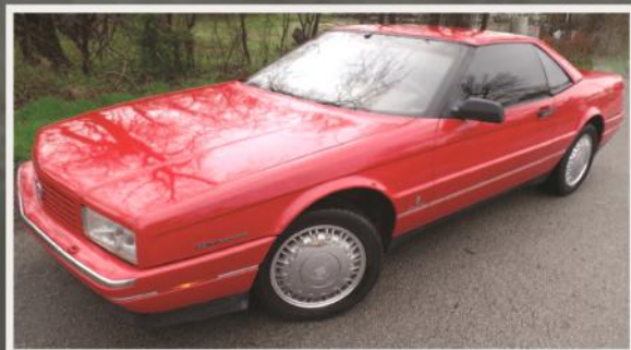
1993 CADILLAC ALLANTE