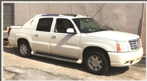
2004 CADILLAC ESCALADE EXT