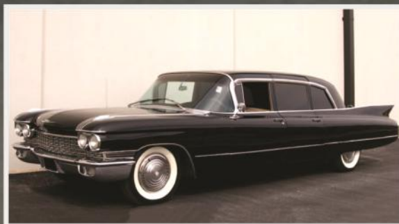
1960 CADILLAC LIMOUSINE CUSTOM