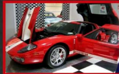
2005 Ford GT Coupe