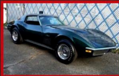
1971 Chevrolet Corvette Coupe