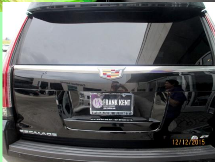
The Toys For Tots collected by the NTXCLC more than filled a brand new Cadillac Escalade, graciously provided by Frank Kent Cadillac.