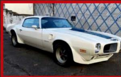
1970 Pontiac Firebird Trans Am Coupe