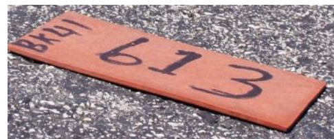
There is one tab for each space at the swap meet.