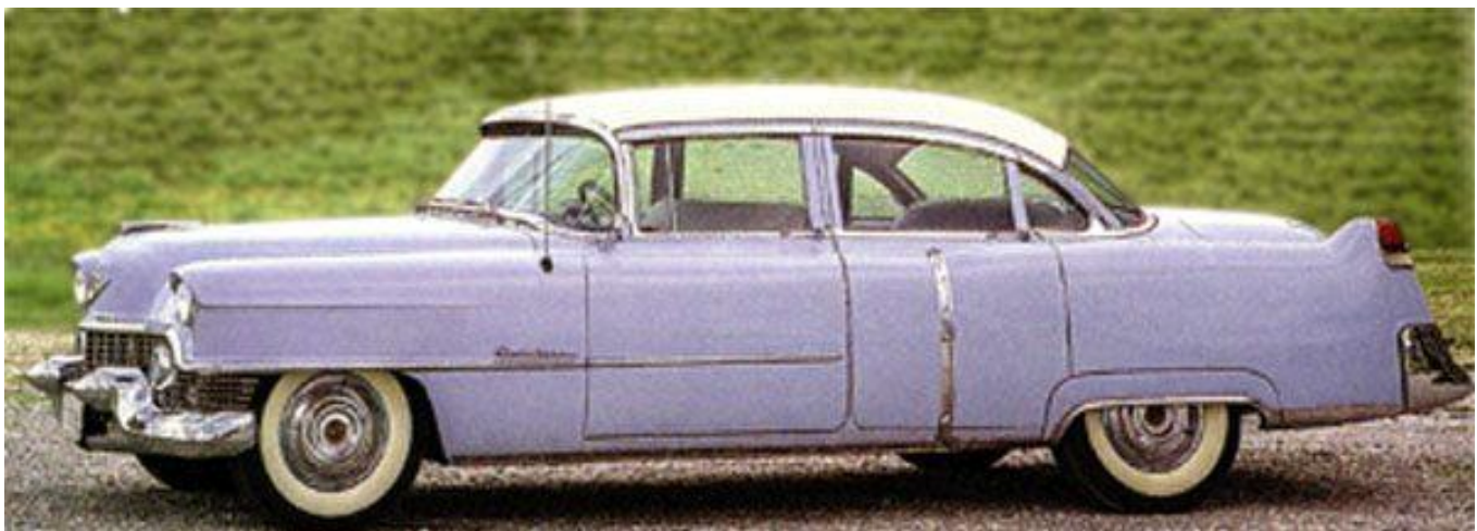
1954 Cadillac Sixty Two Series