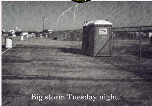
Big storm Tuesday night.