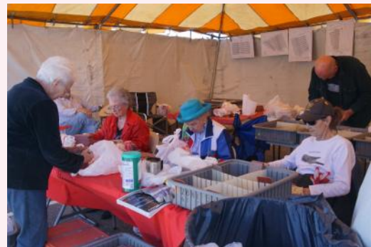
Tile sorting and organizing at tear down day.