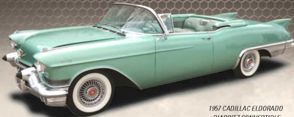
1957 CADILLAC ELDORADO BIARRITZ CONVERTIBLE - OFFERED WITHOUT RESERVE -