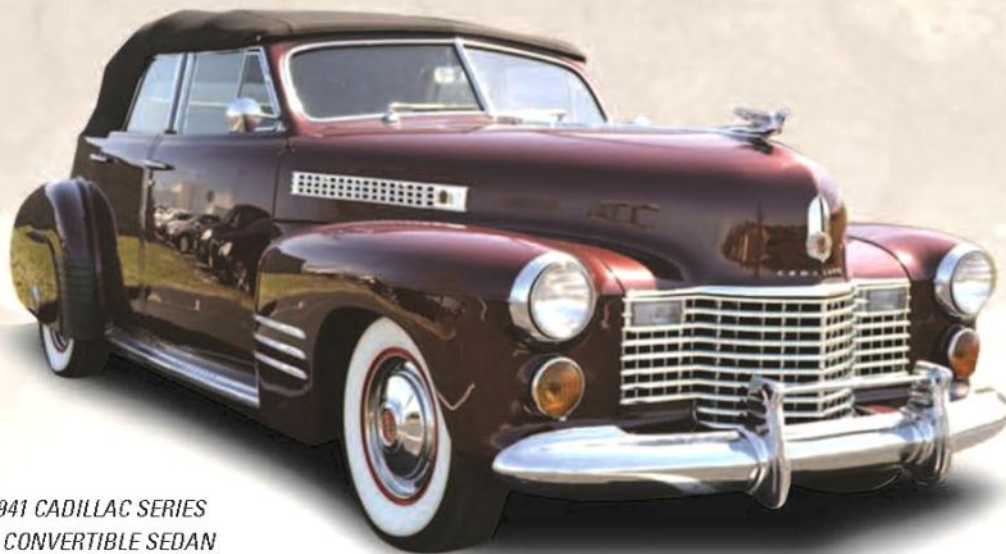
1941 CADILLAC SERIES 62 CONVERTIBLE SEDAN