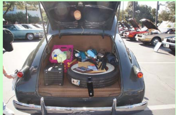
Lots of room for luggage and clutter. The factory even included an assortment of hand tools. There is a lock on the lid and a light in the interior.