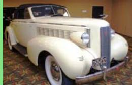
1937 Laalle Coupe, Dave Eckberg