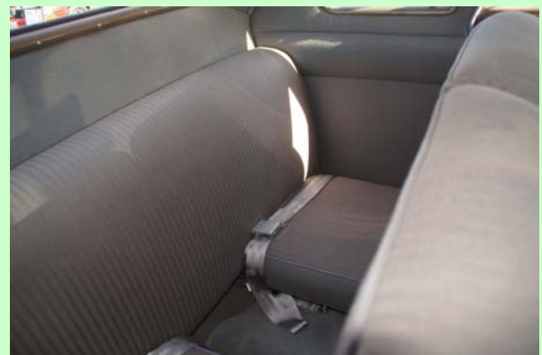
The rear area behind the front seat is fitted out very handsomely. The seat belts on the jump seats are extras.