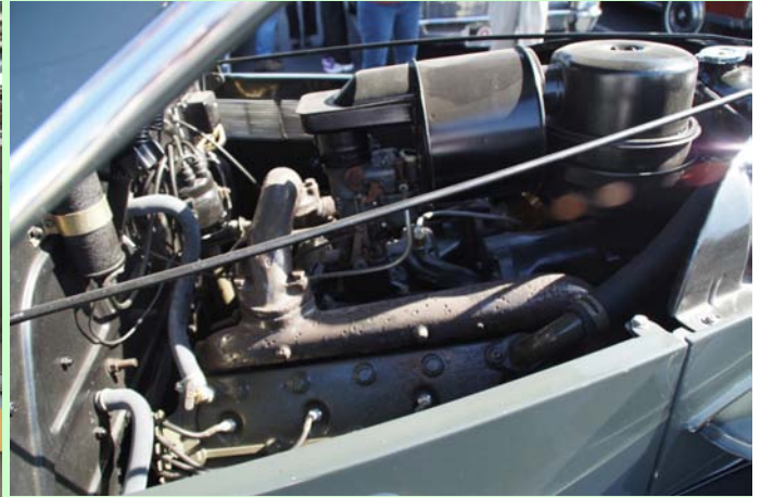
The V-8 engine, used since 1937, was very strong at low RPMs and used 3.92 gear ratio in the rear axle.