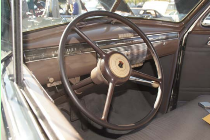
The interiors were considered roomy for its class and promoted as very comfortable. Three passengers could sit in the front seat as the shift lever was now on the column.