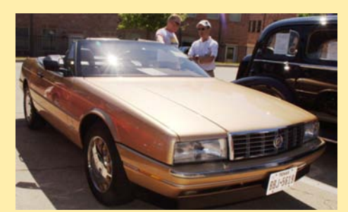
Ron Fishell's 1987 Allante