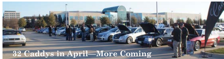
32 Caddys in April—More Coming

May 4, June 1- Cars and Coffee, 8am – Noon. Get there NLT 7:30 for a reserved spot on Cadillac Row as the lot fills up fast after 6:45 am. 6800 Dallas Parkway, Plano TX 75024 Email lifer@writeme.com that you will be there.