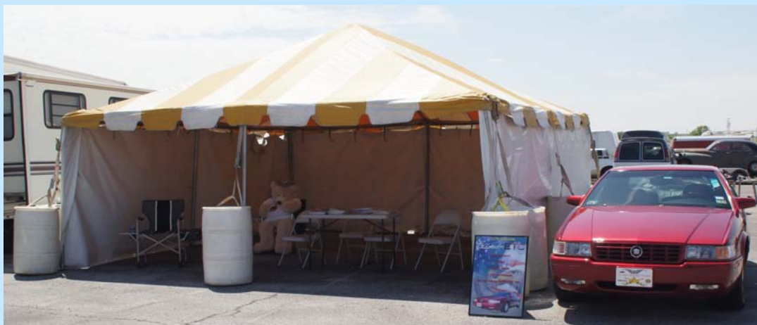
Thursday April 25 at the NTXCLC Hospitality tent. It gets better—pictures next month.