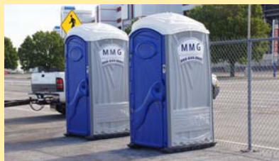
Pate Worker's Office