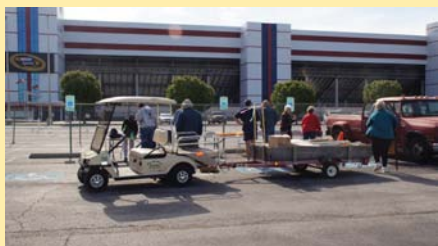
Pate Special Delivery