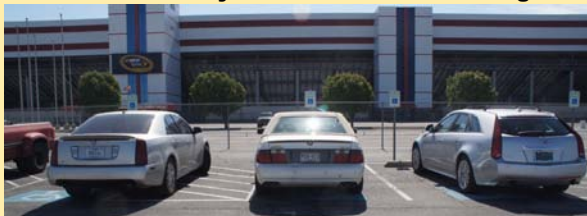
Some Cadillac Workers brought their Cadillac