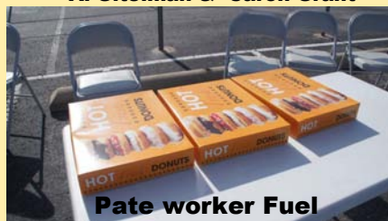
Pate worker Fuel