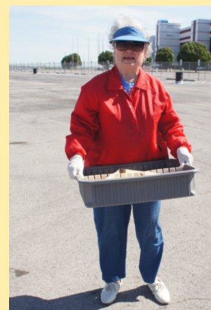
That tray of space markers weighs over 35 lbs full.