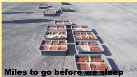
Miles to go before we sleep