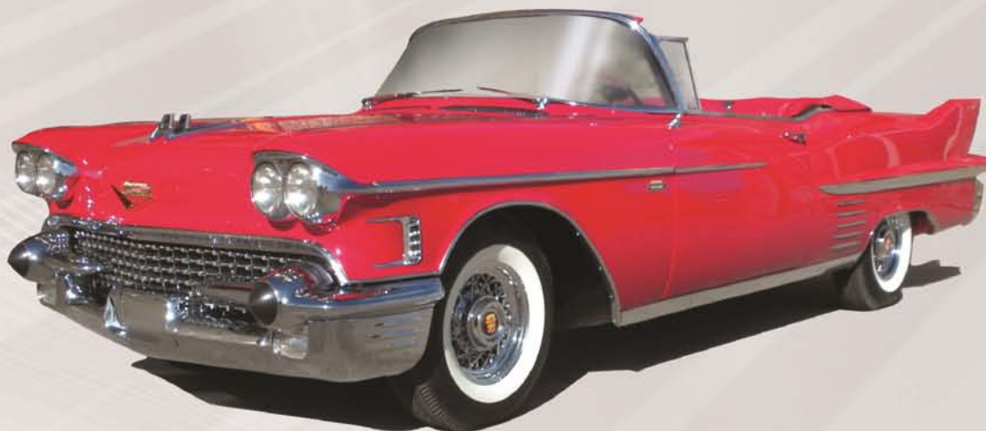
1958 CADILLAC SERIES 62 CONVERTIBLE 365 CI / 350 HP V-8 engine • Automatic transmission • Autronic eye headlight dimmer • Power steering • Power brakes • Power windows • Power seats • Power antenna • Remote outside mirror • Push-button radio • Cadillac wire wheels • Haartz top • Professional body-off frame rotisserie restoration completed January 2014