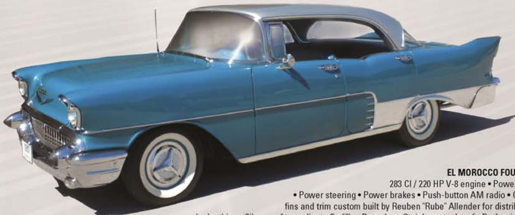
1957 CHEVROLET EL MOROCCO FOUR DOOR HARDTOP 283 CI / 220 HP V-8 engine • Powerglide transmission • Power steering • Power brakes • Push-button AM radio • Cadillac body work, fins and trim custom built by Reuben "Rube" Allender for distribution by Chevrolet dealerships • Silver roof to replicate Cadillac Brougham Stainless steel roof • Professional body-off frame restoration • One of only 3 - 1957 four door hardtops known to exist of the 16 produced