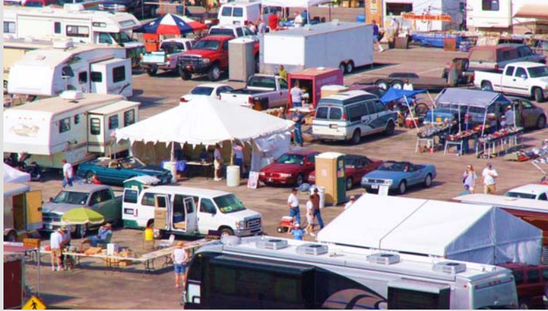
This is the NTXCLC Tent.