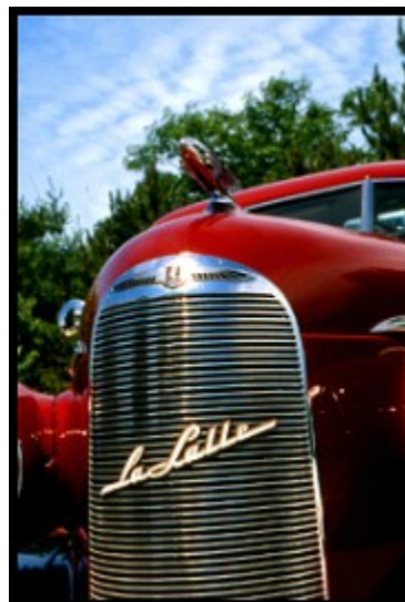
Cadillac & LaSalle Club Photo Gallery