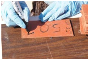
Each tile has to be checked, and possibly darkened or recreated.