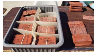
Here is a close up of a bin, and it's tiles.