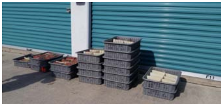
There are multiple bins for each zone and hundreds of tabs in each bin.