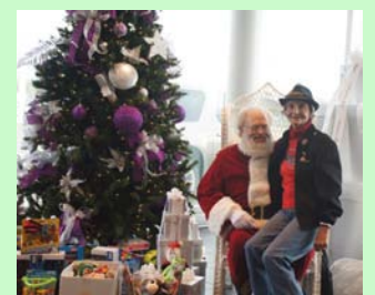
And what do you want for Christmas, little girl?