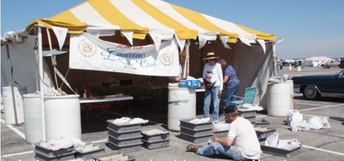
As the vendor tiles are retrieved they are sorted into the proper bins for further adjusting. This takes a good size crewto do it.