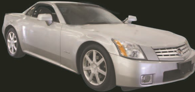
2006 CADILLAC XLR CONVERTIBLE