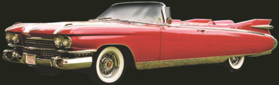
1959 CADILLAC ELDORADO BIARRITZ CONVERTIBLE