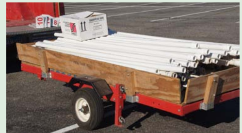
Poles, poles, poles, all destined to become street signs