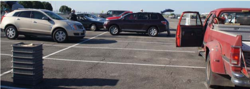
Trucks, SUVs, Vans, Trailers, it takes some equipment to handle this event.