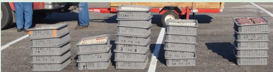
Eight-thousand rubber tile markers, sorted, redrawn, organized and ready for Distribution in 45 lb tubs. Hoo boy, it's a real workout muscling these guys.

It rained all week in North Texas, but Saturday, April 25, 2015 brought clear skies and bright sunshine. The North Texas Region Minions along with the Horseless Carriage Club proceeded to turn a multi-acre, flat, bland, parking lot into the underpinnings of the great big Pate Swap Meet, scheduled to begin April 30th. Almost 8,000 markers, enough 45 lb concrete sign bases to sink the Bismark, and the ever-present sign poles and signs that guides the thousands of vendors and visitor onto streets of sales of all kinds. A big THANK YOU for all who came out to work. You earned a free Christmas Holiday dinner for sure.