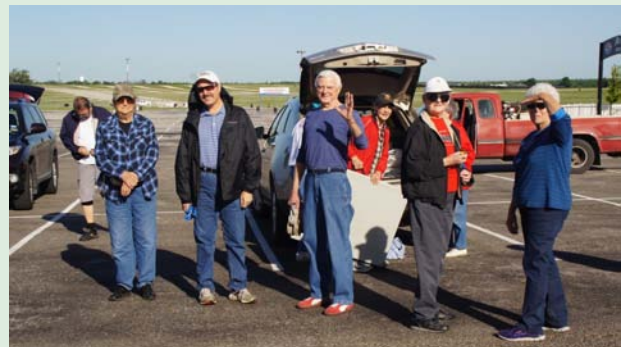
Part of the crew ready to take on the morning.