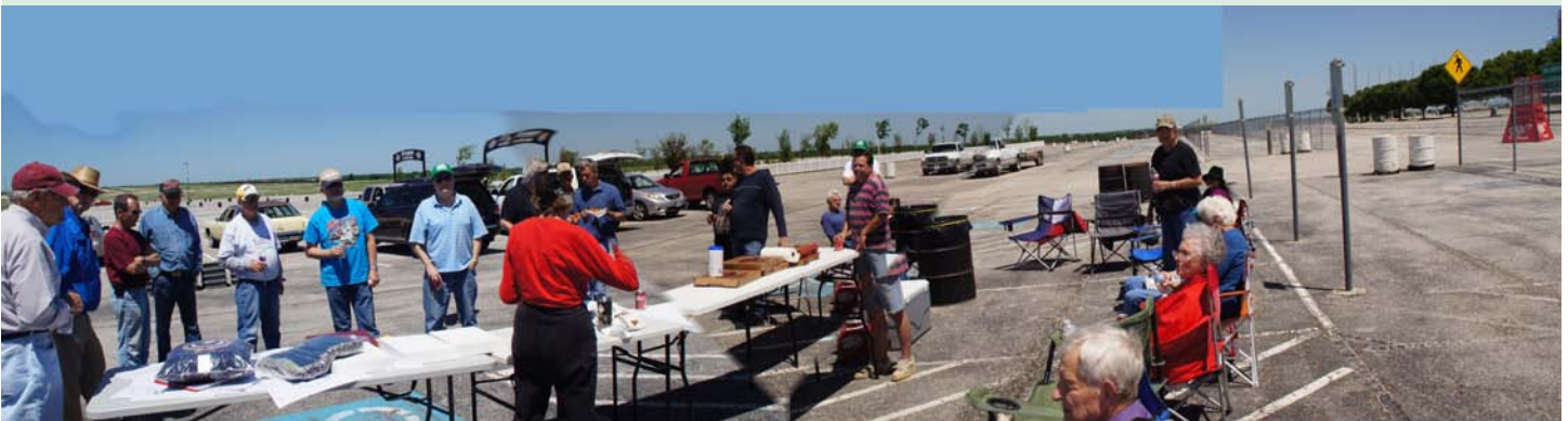
Lunch and reorganize for any last minute things that still need attention. By 2:00 p.m. we were done for the day, which began at before 8:a.m.