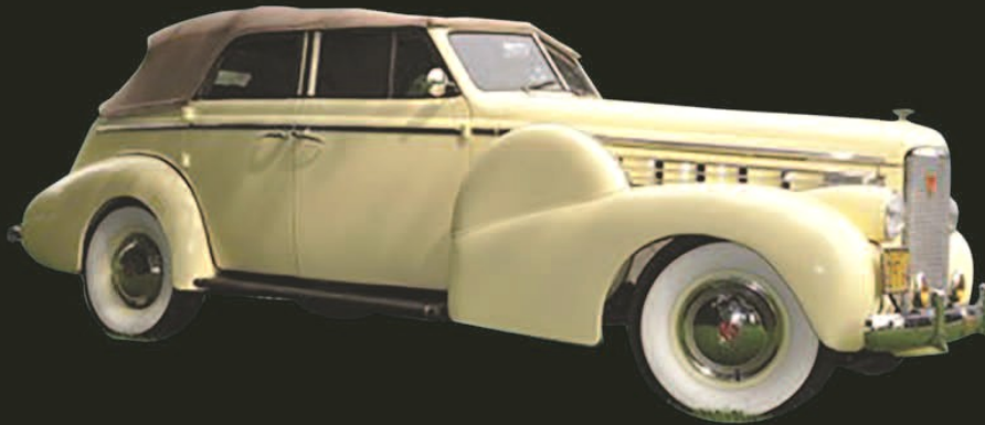
1938 CADILLAC SERIES 50 CONVERTIBLE