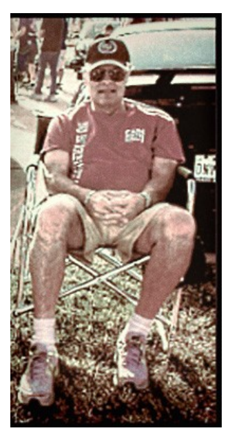
TIP OF THE DAY: You have to get up early in the morning to get a good spot on Cadillac Row at Cars And Coffee- Lifer

WALLACE W. WADE SPECIALTY TIRES Dintage Cires ANTIQUE & CLASSIC CARS - TRUCKS MILITARY - TRACTORS