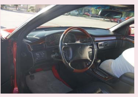
Eldorado interior is upscale, easier to maintain, more techno stuff, tight on room, but comfortable and luxurious.

Allante interior—well done, high tech, difficult to service, quiet, and like no other GM car. The 1993 seats were now the Eldo seats, but considered comfortable. Roomy and mainly designed for luxury, not sports.