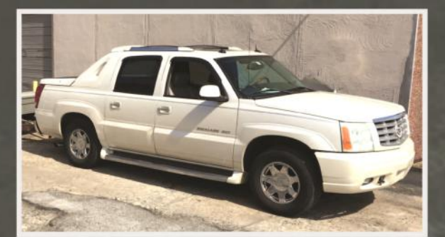
2004 CADILLAC ESCALADE EXT