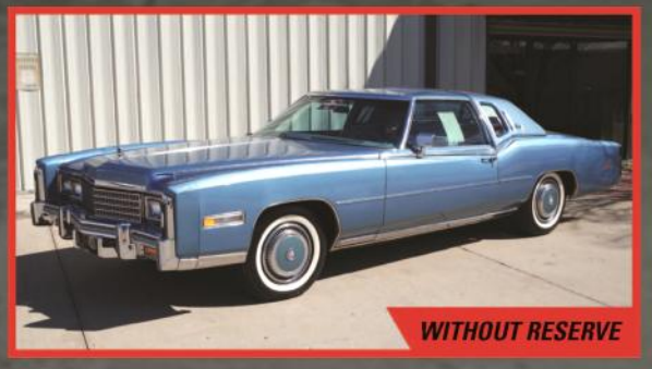
1978 CADILLAC ELDORADO BIARRITZ