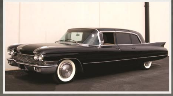
1960 CADILLAC LIMOUSINE CUSTOM