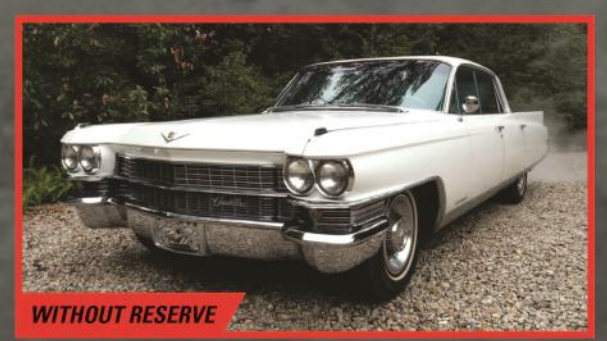
1963 CADILLAC FLEETWOOD 60 SPECIAL