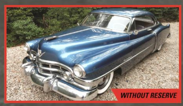
1950 CADILLAC SERIES 61