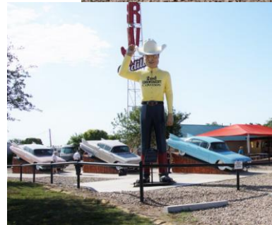
Cadillac Ranch gift shop