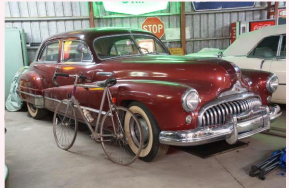
1947 Buick Series 70 Roadmaster Sedan