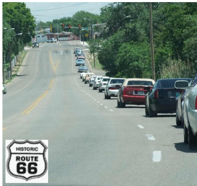
Here on historic Route 66 our 19 Cadillac convoy travels through town.

Now it was time to head our gaggle of Cadillacs in year formation (the oldest at the front) out to the second largest canyon in the U.S., the Palo Duro Canyon State Park. Consisting of 29,182 acres of scenic grounds in the northern most portion of the canyon, it was formed by water erosion from the Prairie Dog Town Fork of the Red River. Its name means "hard wood," because of the abundant Mesquite and juniper trees. Historically it has been inhabited by humans for over 12,000 years, including nomadic tribes, Apache Indians, and then later by Comanche and Kiowa tribes until 1874. Then the Army moved the Native Americans to Oklahoma. In 1876 Charles Goodnight entered the canyon and opened a ranch called the JA ranch with over 100,000 head of cattle. The ranch, now much smaller, still operates today. (Continued...)