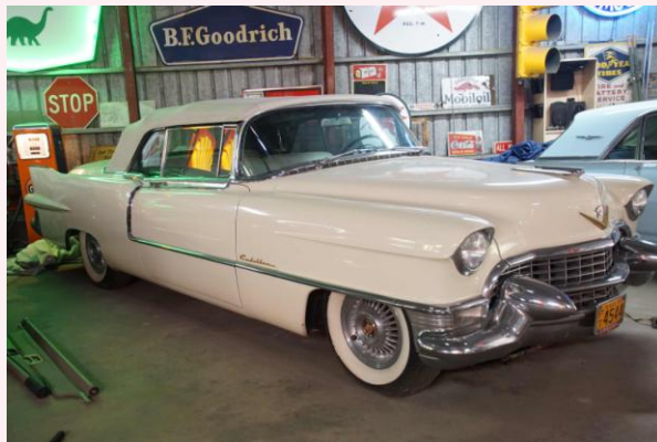
1955 Cadillac Eldorado Convertible