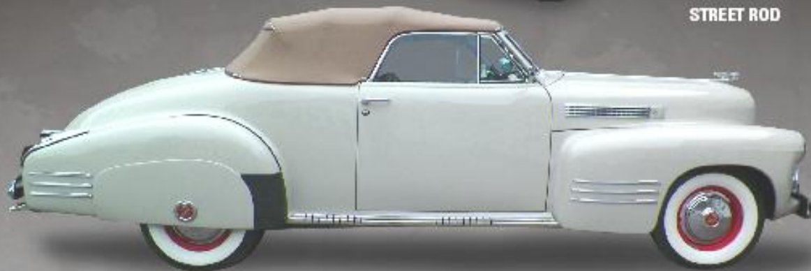
1941 CADILLAC CONVERTIBLE - SELLING WITHOUT RESERVE ON SATURDAY