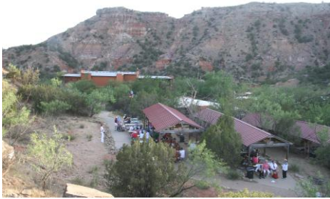
Above is the Chuck Wagon Bar B Que and eating area.

Because of the rich history the Palo Duro offers, a stage play called TEXAS plays all summer long. With over 60 actors, singers, and dancers in period costumes playing out historical dramas of the settlers of the Panhandle in the 1880s in the pioneer amphitheater, it makes an evening worth the trip. We enjoyed a back-stage tour, a great chuck wagon “bar-b-que” dinner, and a fantastic show, complete with a finale of fireworks and water display show in honor of the military at the end. What a show it was.