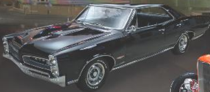
1966 PONTIAC GTO