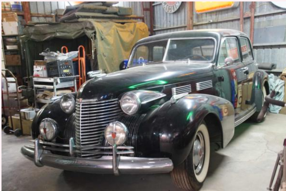
1940 black Cadillac four-door Series 62 town sedan