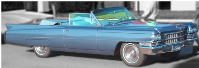
John Serfling 1963 Series 62 Convertible