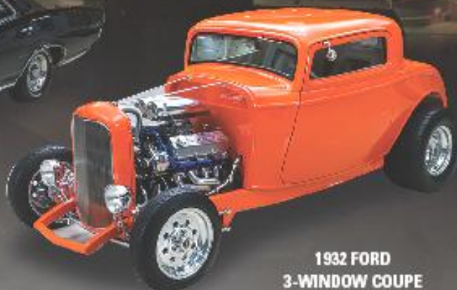
1932 FORD 3-WINDOW COUPE STREET ROD