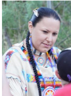
Left and right: Two well dressed Comanche Native Americans were on hand before the play to talk to the visitors and answer questions, and both had parts in the play.