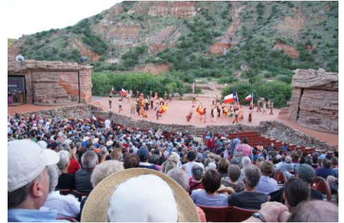
A view of the outdoor stage of the TEXAS play. As it got dark the hillside was lit.