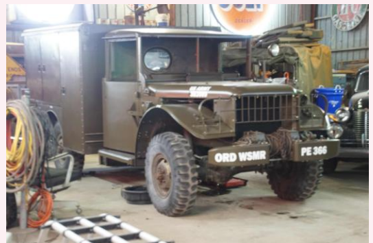
Charlie's son is restoring this M-37 3/4 ton Army truck. It looks fantastic.