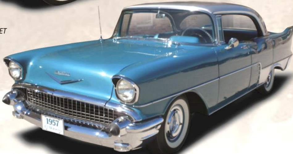
1957 CHEVROLET EL MOROCO