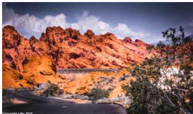
Some of the beautiful scenery at the Valley of Fire