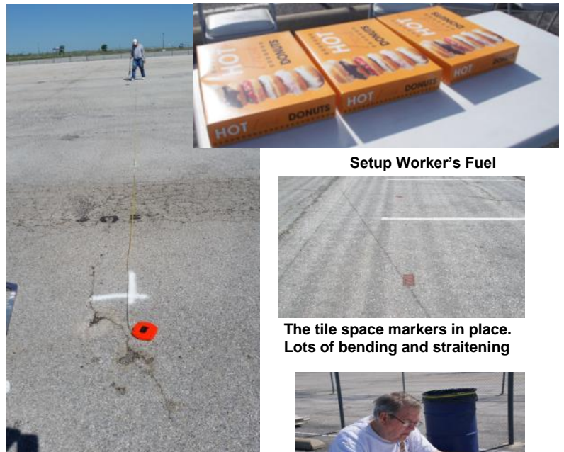
Jim Warren and Bill Levy spending a sunny day before setup measuring the unmarked Zone Zero with tape and paint. There are over 1,554 spaces in this zone.