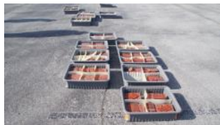
Some of the 8,000+ space tiles to be put out today.