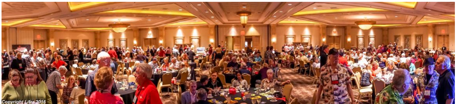
Wednesday's Welcome Reception and CLCMRC Benefit Auction