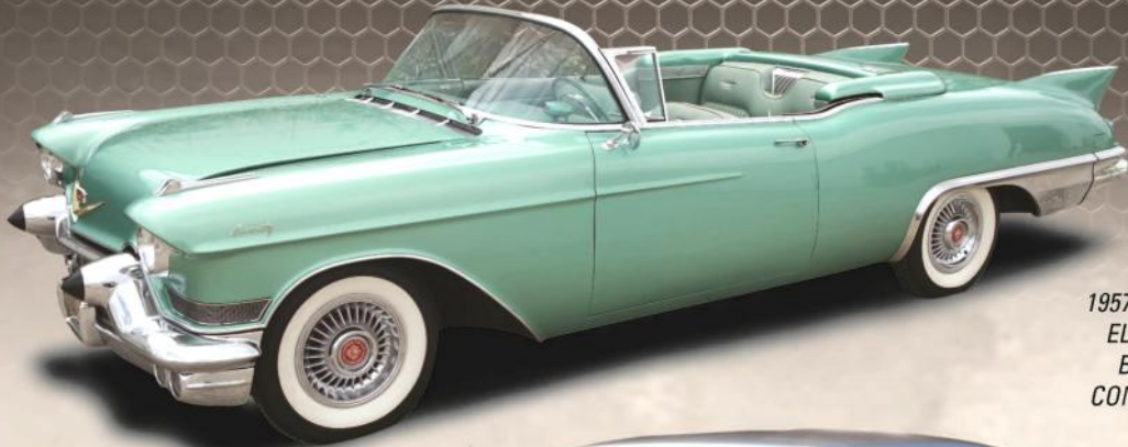
1957 CADILLAC ELDORADO BIARRITZ CONVERTIBLE