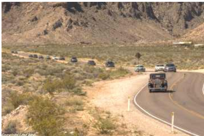
Valley of Fire Cadillac Convoy lead by a beautiful 1929 LaSalle