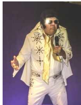
The auctioneer for the CLCMRC Benefit Auction was non other than Elvis Hissself.