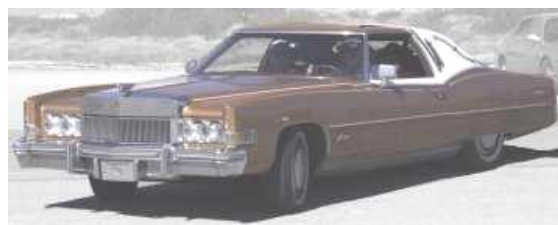
1974 Cadillac Eldorado Hardtop Custom