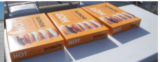
Setup Worker's Fuel