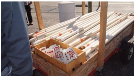
The sign pole and signs cart. Poly poles with slots for the signs and threads for screwing into the cement bases.

Next month, more on the swap meet itself.