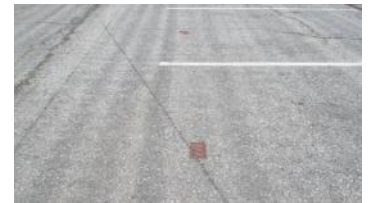
The tile space markers in place. Lots of bending and straitening