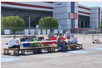
Break and refreshment station for Pate Workers.