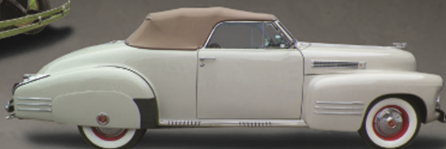
1941 Cadillac Series 62 SOLD in Detroit $66,000

Proceeds to the CCCA Museum at the Gilmore