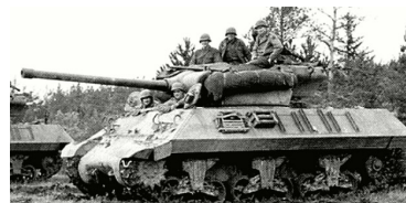
M-36 Tank Destroyer

Tanks, Tank Destroyers and Prime Movers: (11,358) M4 Series Tanks, (1,799) T28E3, T26E4, M26 Tanks, (5,368) M10 Tank Destroyers, (487) M36 Tank Destroyers, (40) M39 Prime Movers.