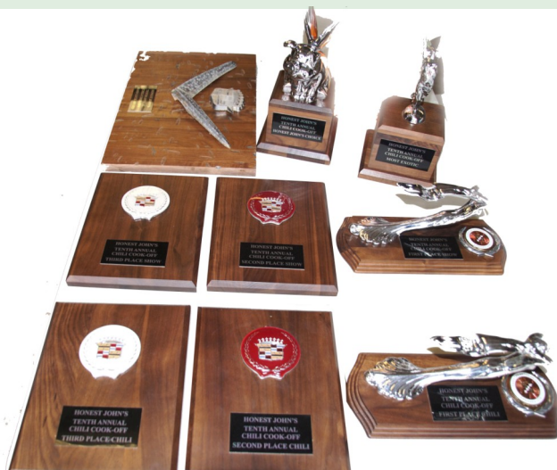
Chili Cook Off and Car Show Trophies

Early birds can start cooking at 11:00 am. Chili turn in at 3:00pm for judging. Award presentation at 4:00pm