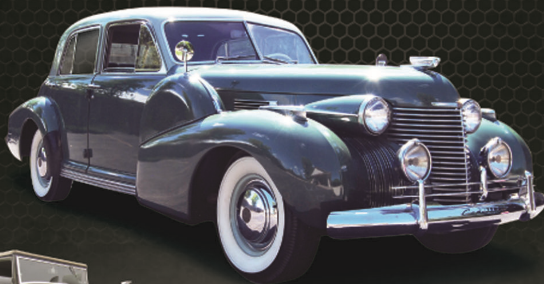
1940 CADILLAC SERIES 60 SPECIAL SEDAN

November 18, 19 & 20 • Dallas Market Hall