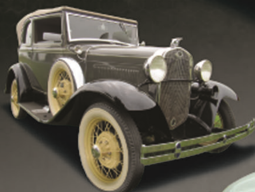
1931 Ford Model A-400 SOLD in Detroit $36,000

Proceeds to the CCCA Museum at the Gilmore