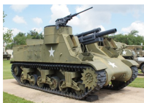
M4A3 Sherman Tank powered by a Ford Engine (Ft. Hood, TX display)

B-29 - (13,772) B-29 Engine Nacelles - These had 1,300 sub-assemblies in them, (unknown quantities) of horizontal stabilizers, vertical stabilizers, rudders, elevators, outboard wing sections, flaps, exhaust collectors, engine cowlings, tail gun turrets and rudder pedals along with many miscellaneous parts.