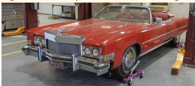
Chuck Bedrri's 1973 Eldorado no belongs to the collection of the Smithsonian National Museum of African American History and Culture.

Best Cadillac song ever—Maybellene. Rest in peace Chuck Berry