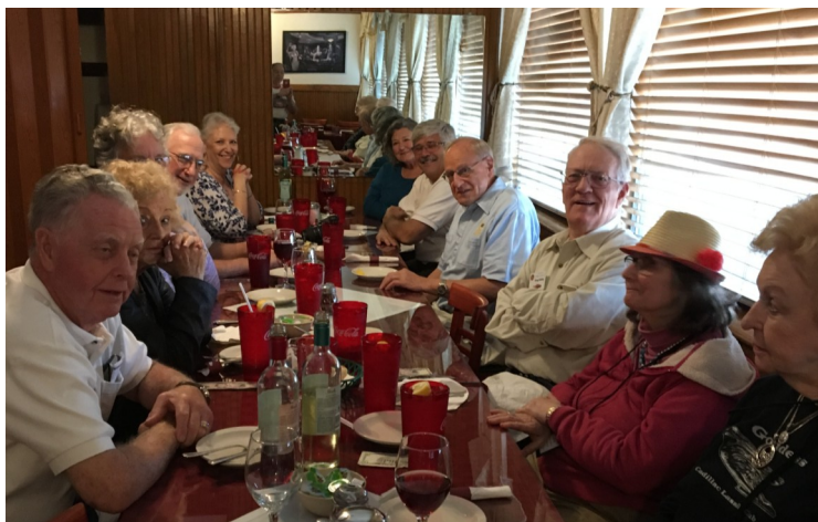
Dinner at Café Italia. It is very warming when friends from all over get to enjoy the comradeship again.