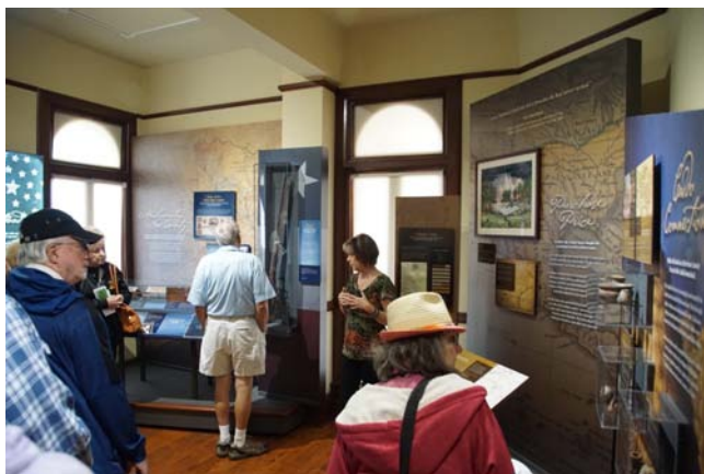
Touring the historical collection at the Harrison County Court House