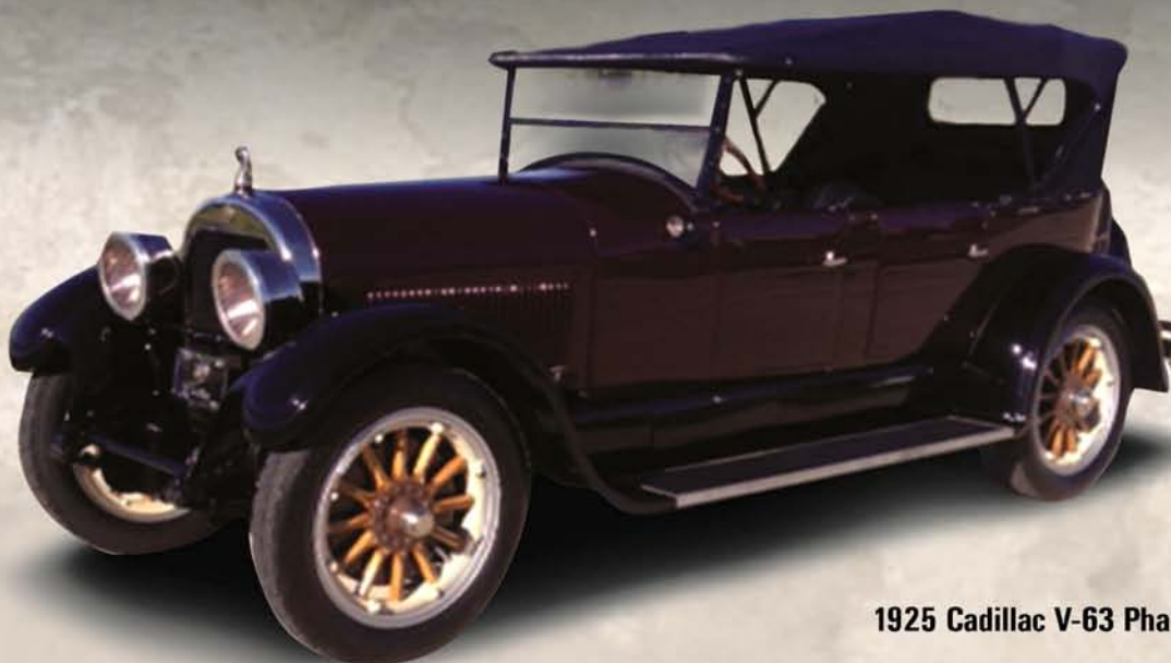
1925 Cadillac V-63 Phaeton

Now Accepting Consignments. Contact a member of our sale's team today!