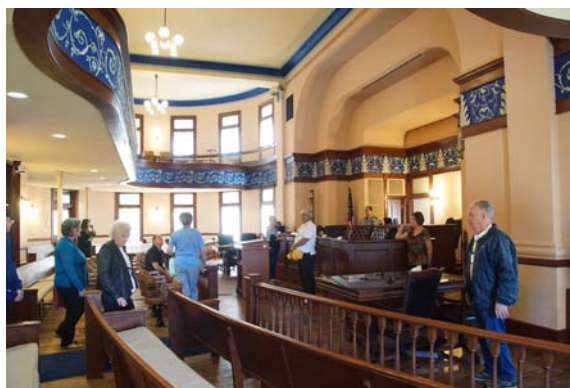
Court Room in Harrison County Court House