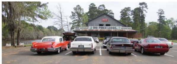
1958 Eldo, '95 and '96 Fleetwood, and '01 Edlorado enjoying the quiet of Caddo Lake.