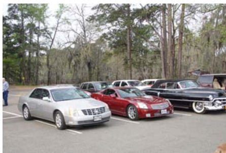
'07 DTS, '06 XLR, '53 Convertible