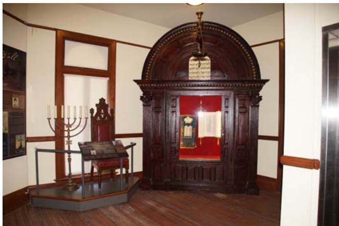
Tabernacle and Torah, and other items from the Jewish synagogue, Temple Moses Montefiore, that used to be in Marshall. It was demolished in 1973 after the decline of the Jewish community from a high of 50 families in 1925.