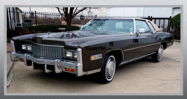
1976 CADILLAC ELDORADO

To Bid or Consign • LeakeCar.com • 918.254.7077