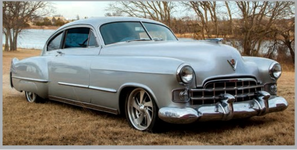
1948 CADILLAC SERIES 62 CUSTOM