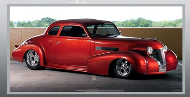
1939 CADILLAC CUSTOM COUPE