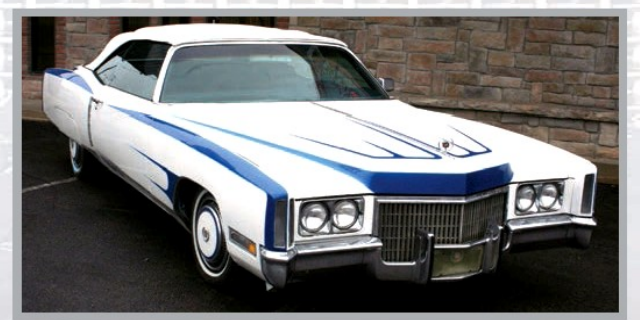
1971 CADILLAC ELDORADO CUSTOM