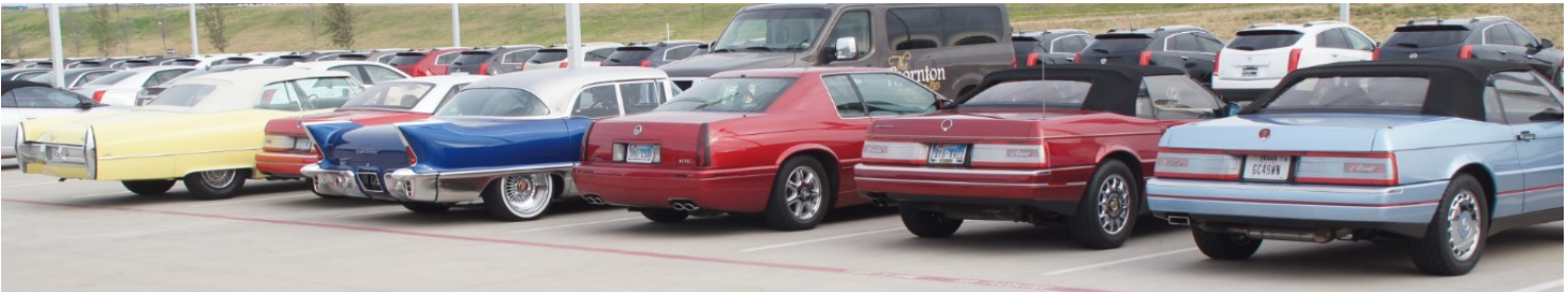
Cadillacs look good even when going.