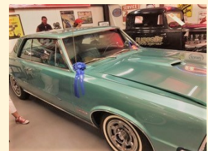
An extremely fine, award winning, 1965 Pontiac Tempest GTO