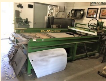
The shop is equipped to cut and shape metal for all needed repairs