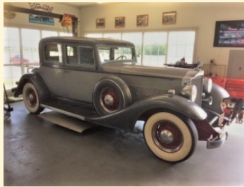
An older classic that demonstrates Gary's attention to detail.