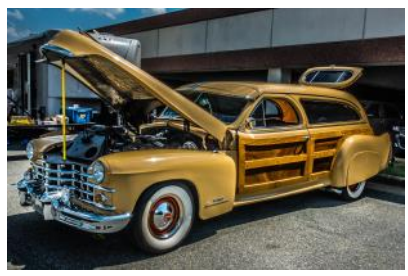
1947 Cadillac, Wagon, Sal Santoro, Sarasoto, FL. A custom built wood-body wagon of impeccable construction