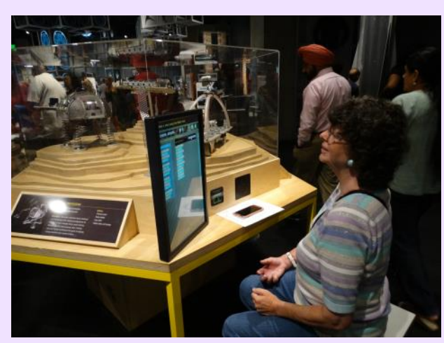
The Perot Museum of Nature and Science has many surprising and interesting displays the both adults and youth enjoy. Some are interactive and allow for an educational experience.