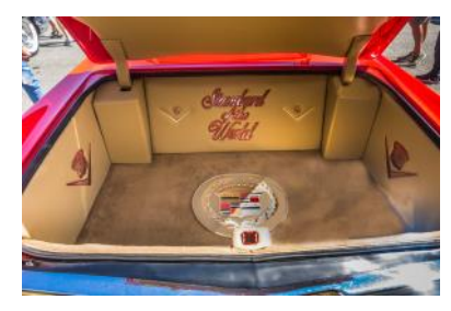
1967 Cadillac Coupe DeVille, the custom trunk celebrating Cadillac's slogan and also this newsletter's masthead.